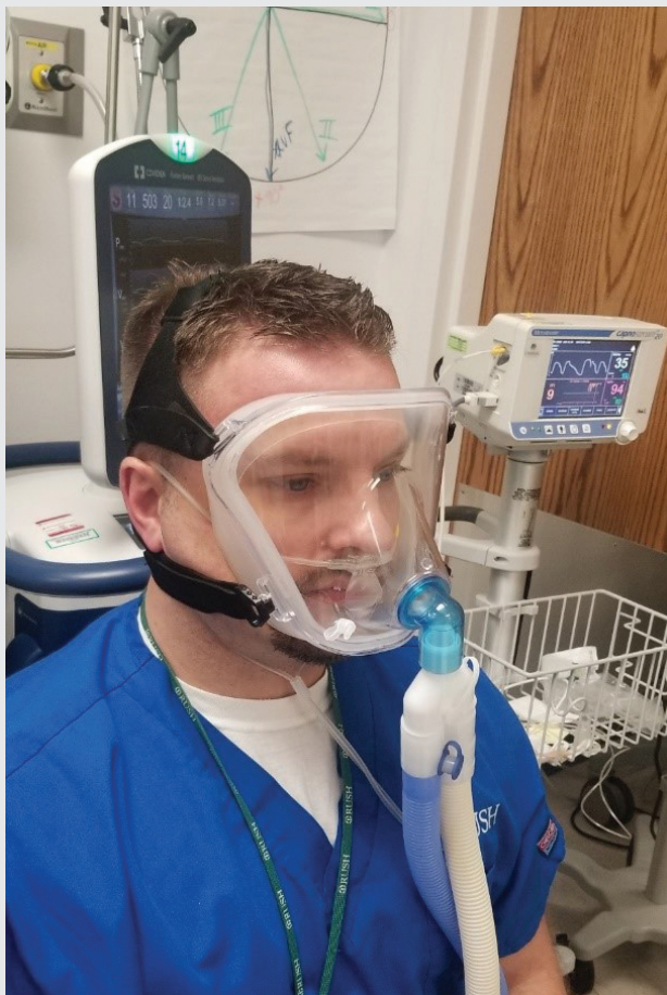
FIGURE 1 Picture of the study setup.

Data were collected into a secure data management system, RedCap (version 6.18.1, Vanderbilt University). Initial baseline vital signs (heart rate, blood pressure, respiratory rate, and oxygen saturation) were obtained and (heart rate, respiratory rate, and oxygen saturation) continually monitored throughout the study. End-tidal partial pressure of carbon dioxide ( P_{ETCO_2} ) and percentage of fraction of inspired carbon dioxide ( F_{ICO_2} ) were obtained at baseline and continuously monitored using an oral/nasal sample line with the Capnostream 20p monitor (Medtronic, Minneapolis, MN). The device measured the percentage of F_{ICO_2} , and it was used to calculate P_{CO_2} . A double limb circuit and 980 Puritan Bennett (Medtronic, Minneapolis, MN) ICU ventilator was used in this study. See Figure 1 for the study.